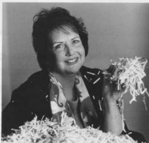
PAPER JAM: I still have the warranty and the receipt from the last 23-inch color television we bought. I just don't have the TV.

and process all of it? Are we simply in love with information for information's sake? If you've ever spent half a day in your pajamas while you fill out your tax return, as I did a few months ago, you can't help noticing that this tsunami of stuff keeps getting in the way. It glazes the eyes. It numbs the brain.